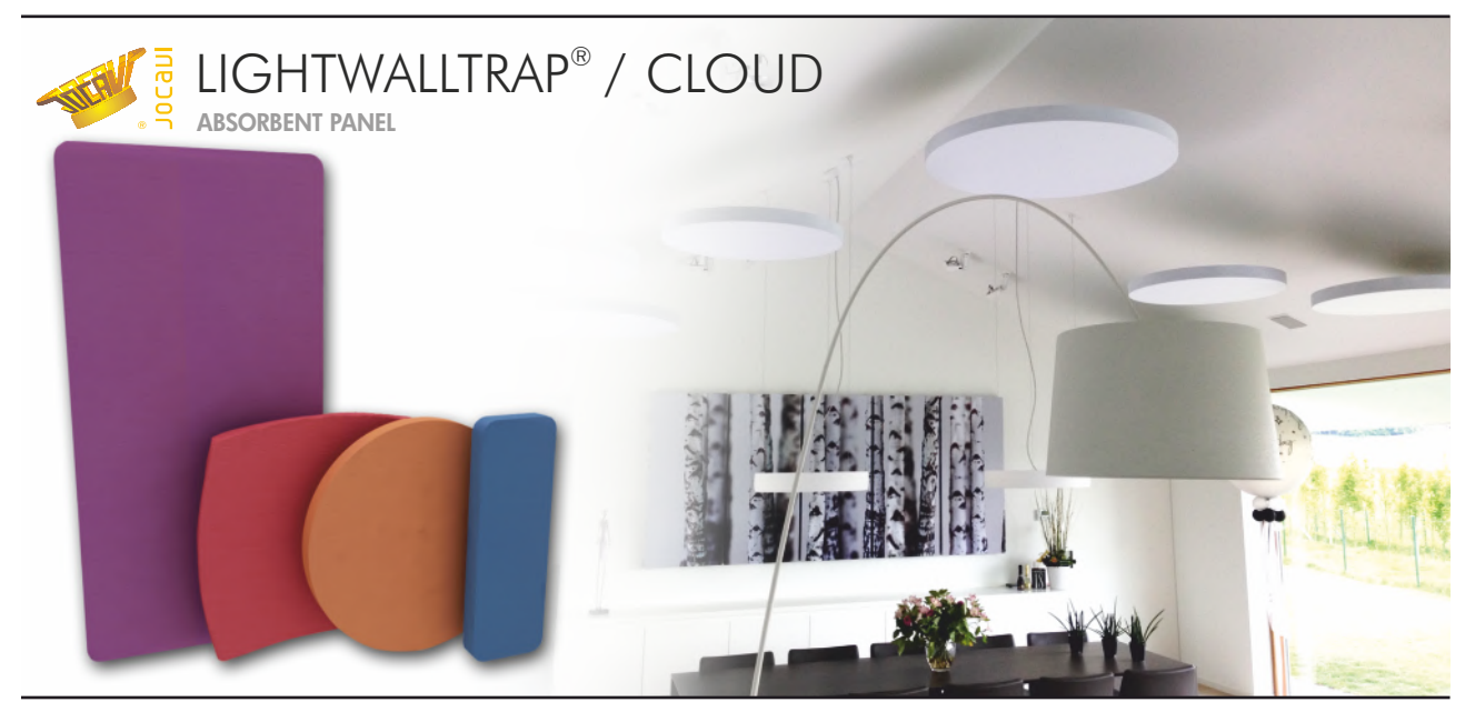
Image of 180x90cm, of the new 90x90cm cloud shape, the 90cm circular panel and 90x30cm model Ref.:LIG180, LIGC090, LIGR090 and LIG030 (on the left) and Ref.:LIGR090 model appplied (ambient image).